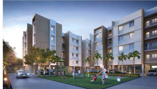
Magnolia Nakshatra, Barasat