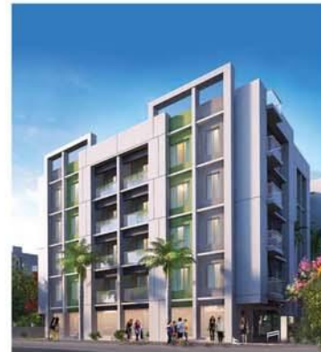
Magnolia Melody, Rajarhat