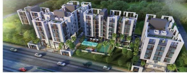
Magnolia Grand, Rajarhat