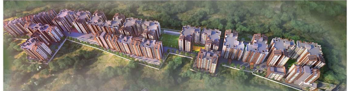
Magnolia Sports City, Barrackpore