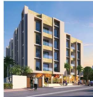
Magnolia Mint, New Town