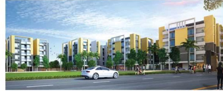
Magnolia Vardaan, Rajarhat