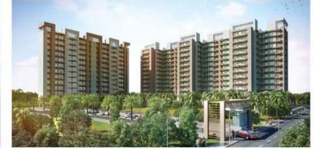
Magnolia Oxygen, Rajarhat